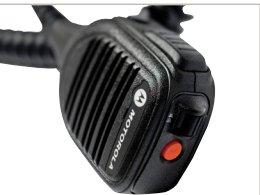
PMMN4081 IMPRES large noise-cancelling remote speaker microphone with 3.5mm audio jack and emergency button, IP55.