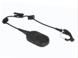
NTN2572 Operations critical wireless earpiece with 12" cable, requires NNTN8191 Operations Critical Wireless push-to-talk pod.