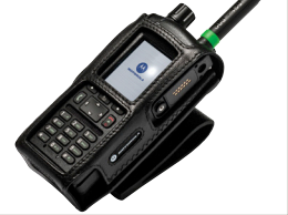
PMLN6249 Hard leather case with 3-inch swivel belt loop, fits full keypad model.